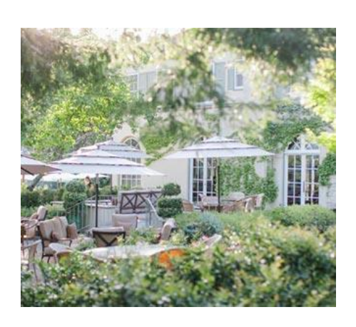
Day 4- Monday, April 29th, 2019

Free evening for dinner and further exploration of Santa Rosa.